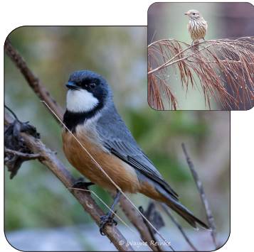
Rufous Whistler Pachycephala rufiventris 15-20cm