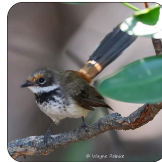
Rufous Fantail Rhipidura rufifrons 12-17cm