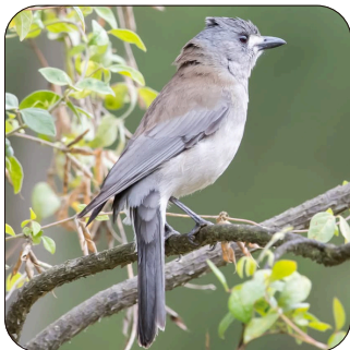
Grey Shrike-thrush Colluricincla harmonica 20-25cm