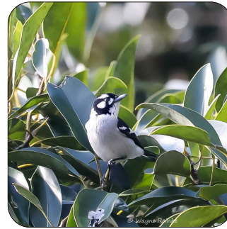
White-eared Monarch Carterornis leucotis