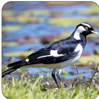
Magpie-lark Grallina cyanoleuca 25-30cm