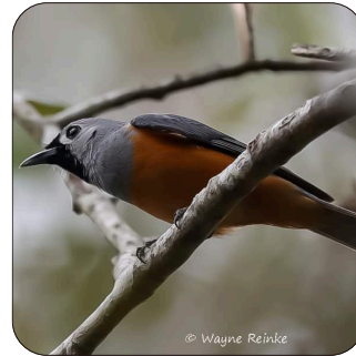
Black-faced Monarch Monarcha melanopsis 15-20cm