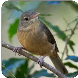
Little Shrike-thrush (Rufous) Colluricincla rufogaster 15-20cm