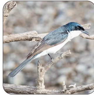
Restless Flycatcher Myiagra inquieta 15-25cm