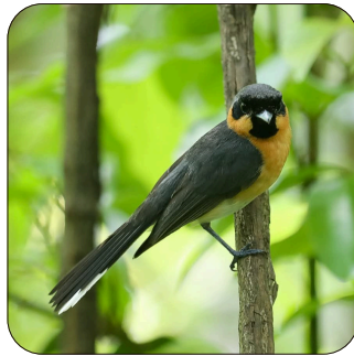
Spectacled Monarch Symposiachrus trivirgatus 14-20cm