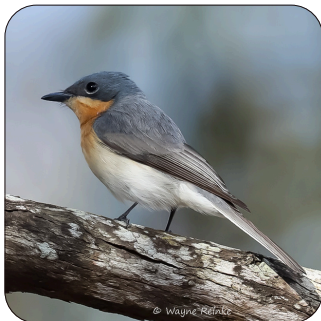
Leaden Flycatcher - Female Myiagra rubecula 13-16cm