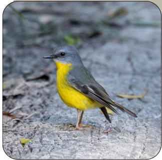
Eastern Yellow Robin Eopsaltria australis 14-18cm