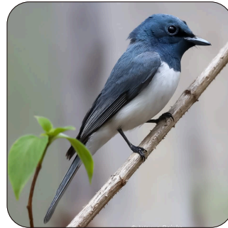
Leaden Flycatcher Myiagra rubecula 13-16cm