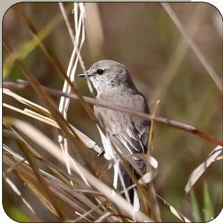
Jacky Winter Microeca fascinans 10-15cm