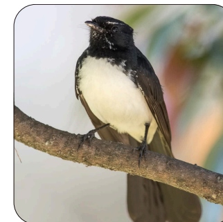
Willie Wagtail Rhipidura leucophrys 15-23cm