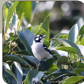
White-eared Monarch Carterornis leucotis