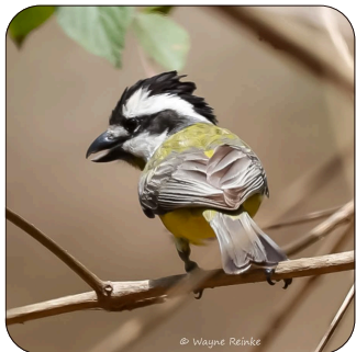
Eastern Shrike-tit Falcunculus frontatus 15-20cm