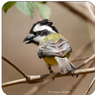
Eastern Shrike-tit Falcunculus frontatus 15-20cm