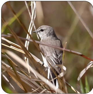
Jacky Winter Microeca fascians 10-15cm