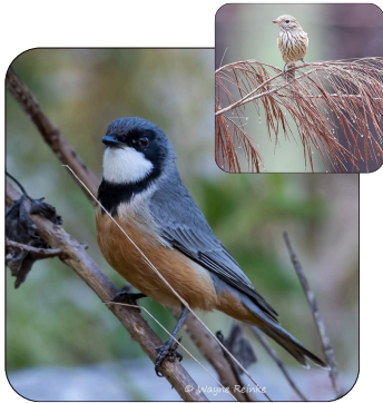
Rufous Whistler Pachycephala rufiventris 15-20cm