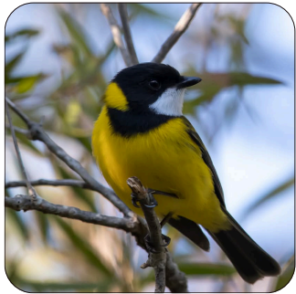
Golden Whistler Pachycephala pectoralis 15-20cm