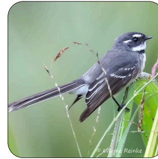
Grey Fantail Rhipidura albiscapa 13-16cm