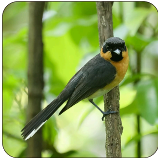
Spectacled Monarch Symposiachrus trivirgatus 14-20cm