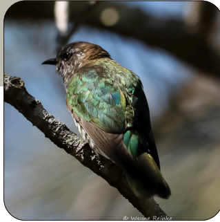
shining bronze-cuckoo Chalcites lucidus 12-25cm