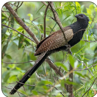
pheasant coucal Centropus phasianinus 45-70cm