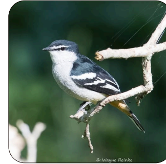
Varied Triller Lalage leucomela 18-20cm