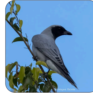
Black-faced Cuckoo-shrike Coracina novaehollandiae 30-45cm