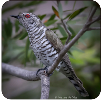
little bronze-cuckoo Chalcites minutillus 14-15cm