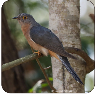
fan-tailed cuckoo Cacomantis flabelliformis 20-30cm