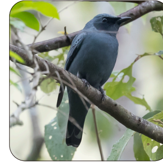
Cicadabird Edolisoma tenuirostre 24-26cm