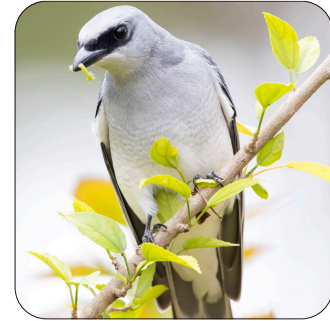
White-bellied Cuckoo-shrike Coracina papuensis 26-28cm