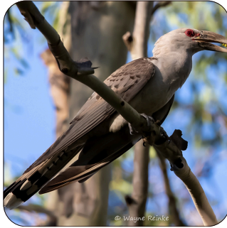
channel-billed cuckoo Scythrops novaehollandiae 50-65cm