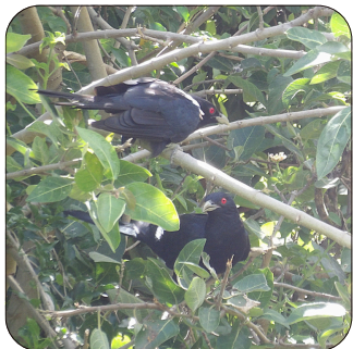
Eastern Koel Eudynamys orientalis 25-45cm