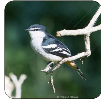
Varied Triller Lalage leucomela 18-20cm