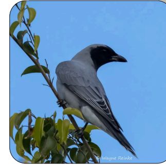
Black-faced Cuckoo-shrike Coracina novaehollandiae 30-45cm