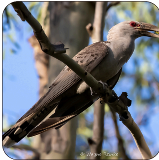
channel-billed cuckoo Scythrops novaehollandiae 50-65cm