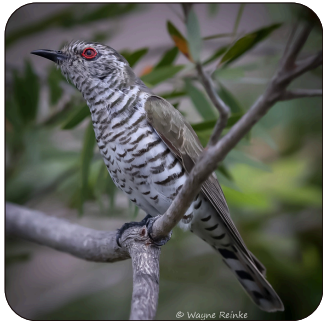
little bronze-cuckoo Chalcites minutillus 14-15cm