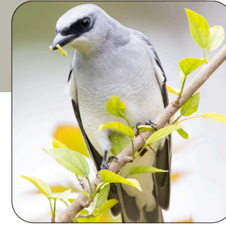
White-bellied Cuckoo-shrike Coracina papuensis 26-28cm