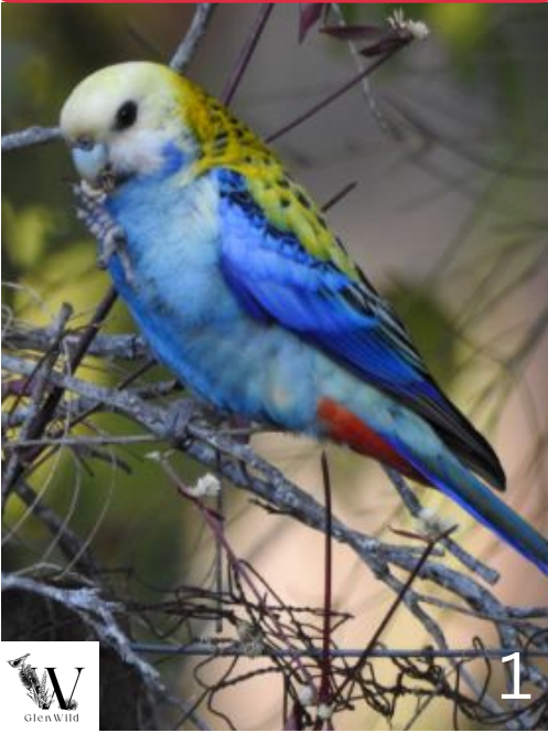
PALE- HEADED ROSSELLA